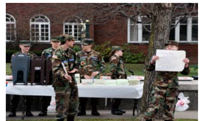
Civil Air Patrol