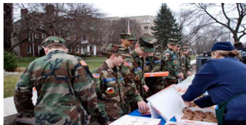
Civil Air Patrol