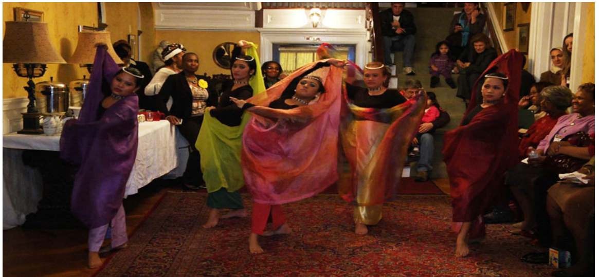
These are the images of diverse international women of GRAB/AAUW

"The folk dances of the 840,000 Dai Ethnic Group in China enjoy not only wide popularity but great diversity. Most of them imitate the movements of subtropical creatures. The percussion instruments used for accompaniment include elephant-foot drums, gongs, and bronze drums. Different dances have their one special drumbeat and drum vocabulary. The drumbeat is not only the tempo of a dance but a kind of language for people to communicate their feelings. The attire of the Huayao Dais looks gorgeous. The jacket made of silk is fully decorated with silver bells and tassels. Huayao Dai has always been known as descendants of the country, the national culture has a long history. Huayao stands for flowery-waist belt in English. Flower belt is like a beautiful rainbow in the hands of the ancient nation of affluence farming, peace and harmony--a vision of a better life."