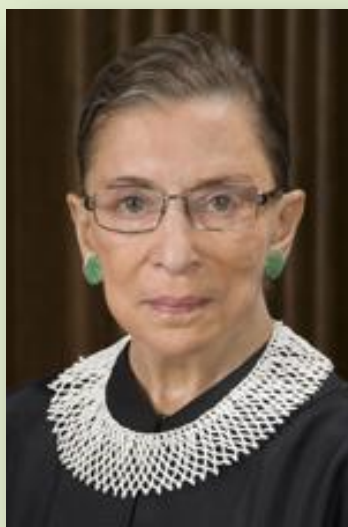
Ruth Bader Ginsburg, U.S. Supreme Court Associate Justice

Please email questions to jwallacejackson@yahoo.com