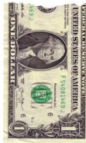
79% White Women

Where women stand in the quest for equal pay