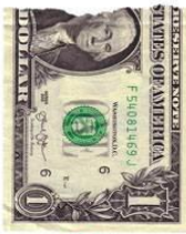
54% Hispanic or Latina