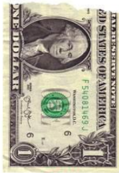
63% African American