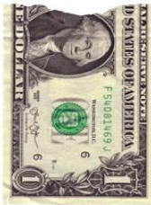
57% American Indian Alaskan Native