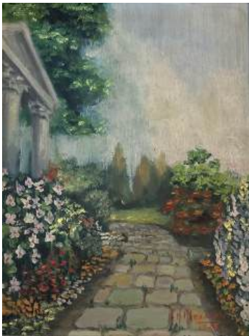
Garden Pathway , J.H. Alexander

The images are of a few of the remaining pieces. More will be posted as we continue with this project. Remember that all purchases support the Perkins Mansion Roof Replacement project.