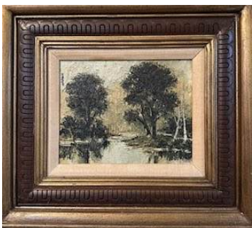
Water's Edge , Unknown