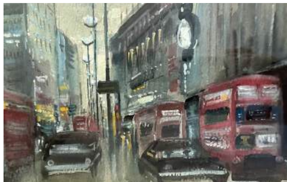
Rainy Day, London, England , Rennie