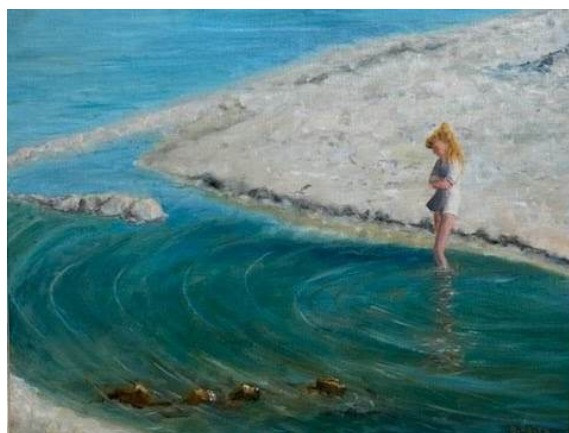
Girl at the Beach , B. Reitz