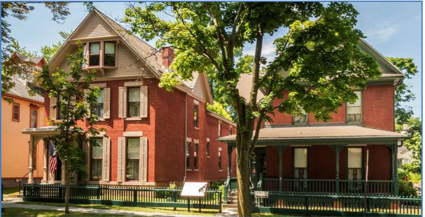
Susan B. Anthony house.