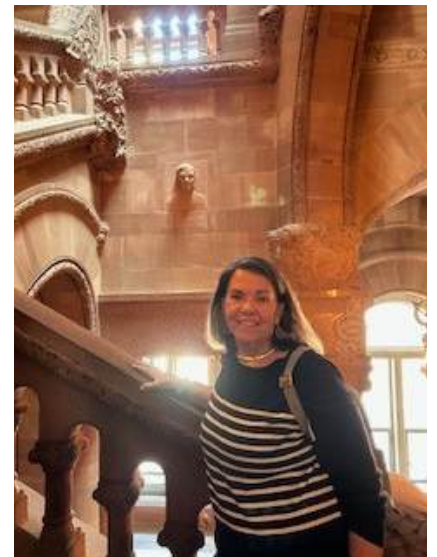
Me on the tour of the State Capitol Building