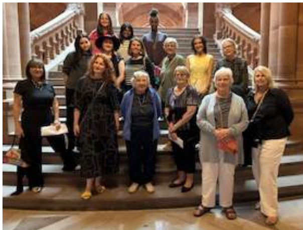
The tour group at the Capitol Building